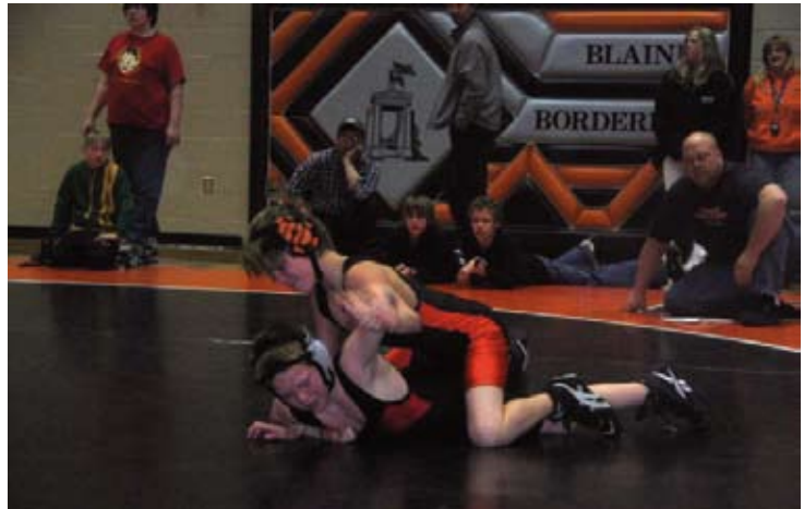
Auto Levels applied