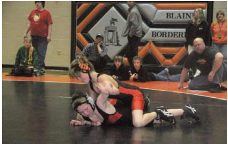
Fixed using our method